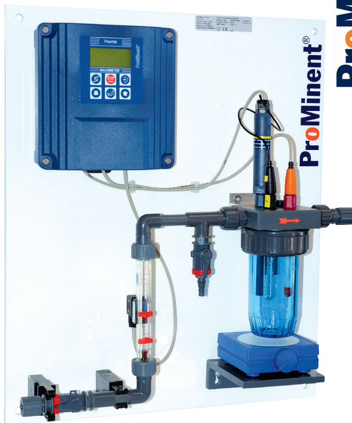
ProMinent® fluoride monitor

Standard unit measures free fluoride with an optional unit available for total.