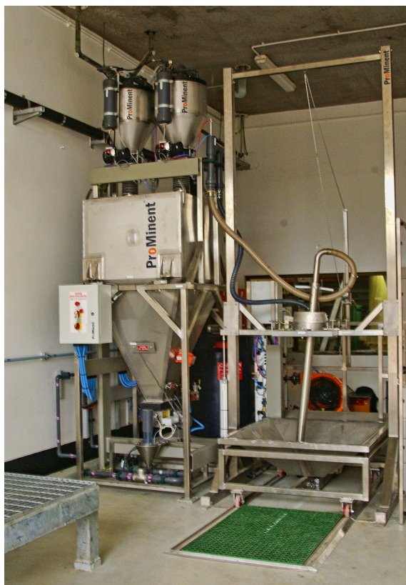
ProMinent® Sodium Silicofluoride 1000 kg bag vacuum load package