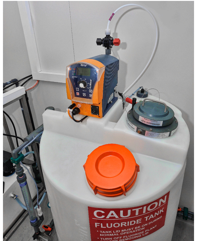
Featuring patented container cutter/loader and water flushing device

The vacuum loader is especially designed for transfer of sodium fluoride granules from 25 kg bags to the solution tank. It is mounted on the saturator and comes complete with dust extractor, flexible hose and suction wand.