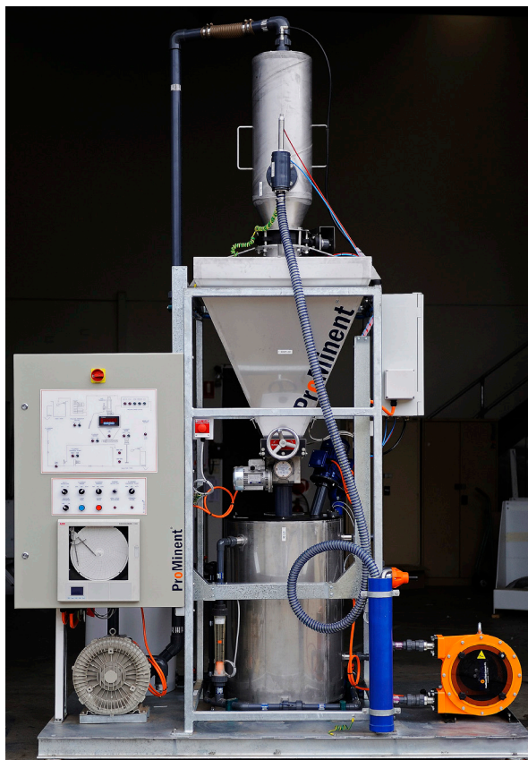
Vacuum load Sodium Silicofluoride package for 25 kg bags

Sodium silicofluoride packages can be supplied with a vacuum loader for 25 kg bags or with 1000 kg bulky bag unloaders either with vacuum transfer or crane, hoist and conveyor feed.